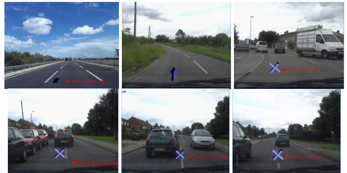
Figure 3: Adaptive AR object placement on road scenes

Overall the usable road area detection approach is successful but can be somewhat dependent on the video image quality. A range of different road examples with AR display is shown in Figure 3 where we see adaptation to a number of road occupancy conditions.